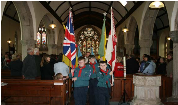
The Colour Party leaving the Church

The Mortonhamstead Group invited the Teign Valley Group along to share in St. George's Day as it was the Teign Valley's first year as a Group.